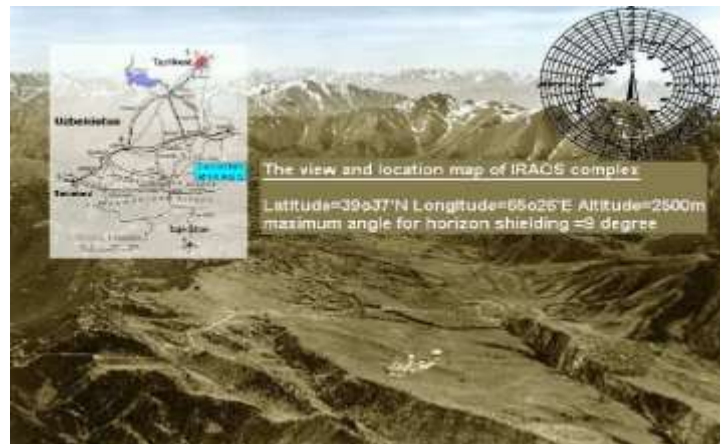
Figure 1. A mountain view of observatory on Suffa plateau. The location map and the telescope horizon shielding diagram are inserted in the left and top right, respectively

atmosphere - image quality, as well as meteorological parameters, such as the amount of clear time, wind speed and direction, are presented in [1].